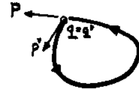
Figure 34.1: A returning trajectory in the configuration space. The orbit is periodic in the full phase space only if the initial and final momenta of a returning trajectory coincide as well.